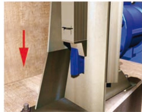
Locking (inside view)