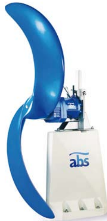
Flow booster performance table