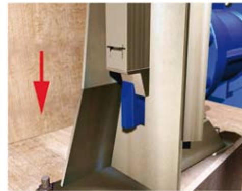
Locking (inside view)