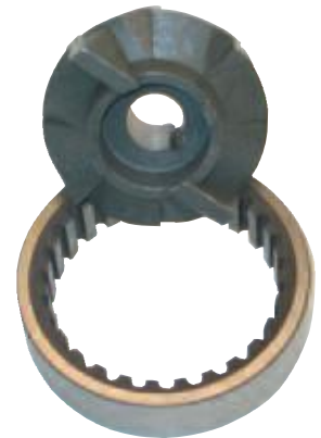
Cutter & Cutting Ring