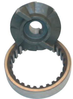
Cutter & Cutting Ring