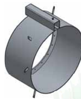
flange for installation in concrete tank

The text and technical data given may not be reproduced partly or completely without permission from Landia A/S. We reserve the right to make technical alterations. AL00B.C15-011108