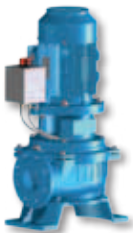
(VS) Short coupled