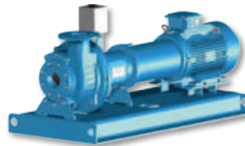
(HM) With spacer coupling, base frame and electric motor