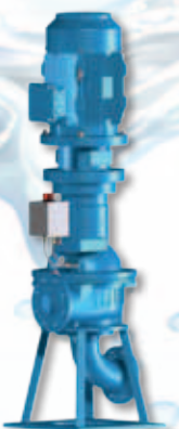
(VM) With flexible coupling and fixed electric motor with optional immersible installation