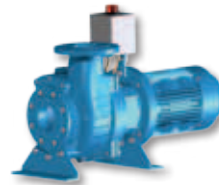
(HS) Short coupled