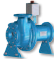
(HX) Bare shaft