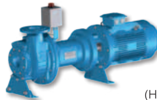
(HF) With flexible coupling, base frame and fixed electric motor