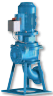
(VS) Short coupled with optional immersible installation