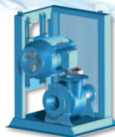
(KM) With frame, V-belt drive and electric motor