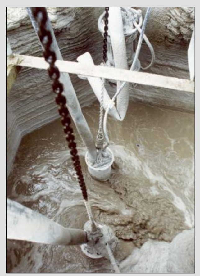
ET10 and DP10 Pumps Concrete factory