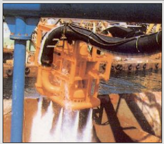
DPA200 Pump Dredging