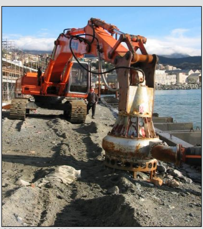
DPH300 Pump Civil works