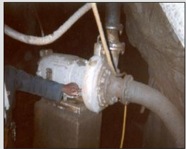
VH20 Pump Mining industry

TOYO pumps have been in operation for more than 50 years in many applications, notably: